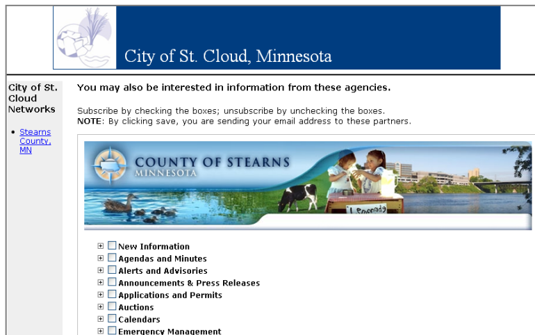
Image: Example of Collaboration Network for a regional audience. Subscribers of updates from the City of St. Cloud are presented with subscription options from Stearns County during signup.